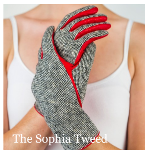
The Sophia Tweed

The Sophia Product Code: 010 Standard size: £49.75 RRP: £115.00